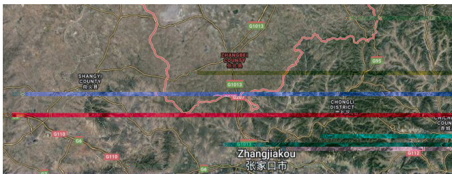
Figure 1. The location information of Zhangbei

Due to the increase of N-TOPCon module installations globally, the research on the outdoor performance of n-TOPCon and p-PERC modules in actual operation conditions became an important issue from the practical point of view. The energy rating (in kWh/kWp) of N-TOPCon and P-PERC modules was analyzed to show the technology-specific differences. The study was conducted in Zhangbei, China, which belongs to temperate continental monsoon climate, devoted to the assessment of two different modules: N-TOPCon modules and P-PERC modules.